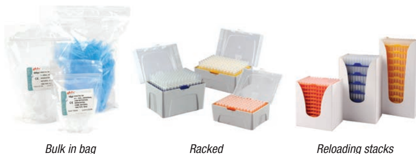
Bulk in bag