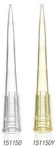
Tips shown actual size